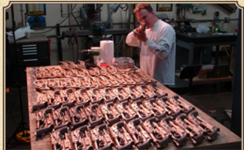
Mal pistols being inspected at manufacturing partner Acme Design. Acme handcrafts each stunt pistol replica to meticulous standards.

Already have an order in for the original Mal pistol design? We'll be happy to take care of you! Please read our conversion policy for preorder customers at the end of this document.